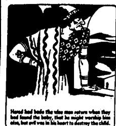
Hand had held the wife man return when they had found the baby that he might worship him also, but will be in his heart to destroy the child.