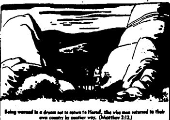
Being warned in a dream not to return to Herod, she was returned to their own country by another way. (Matthew 2:12)