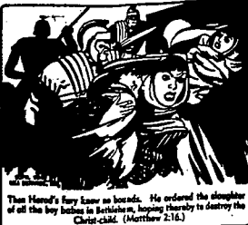
Then Herod's fury knew no bounds. He ordered the slaughter of all the boys between in Bethlehem, hoping thereby to destroy the Christ-child. (Matthew 2:16)