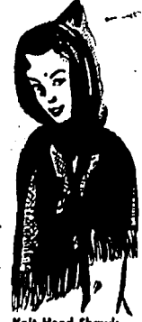
Knit Hood Shawl Warm and Cozy $1.98

A novel-practical-pretty gift. Plastic box holds a beautiful pure silk scarf. Full 32" squares in assorted prints.