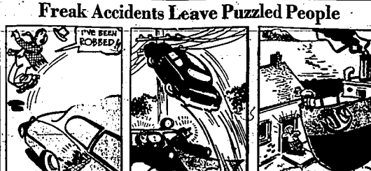
Old mishaps of 1949 include those freak events, as reported by the National Safety Council. Some of the others reported in the U. S. this year were just as crazy and dead likely to happen—but they didn't.