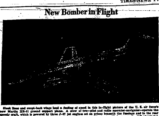
Black Hawk and swept-back wings lead a fleet of speed in this in-flight picture of the U. S. air force's new Martin XB-31 ground support plane. A crew of two-pilot and radio operator-navigators operate the speedy craft, which is powered by three 2-47 jet engines set on pylons beneath the fuselage and in the rear of the craft. The wings, of approximately 80-foot span, are swept back at a 25-degree angle.