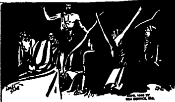
John told his listeners, "There cometh one mightier than I after me, the latchet of whose shoes I am not worthy to stoop down and untie." (Mark 1:7.)