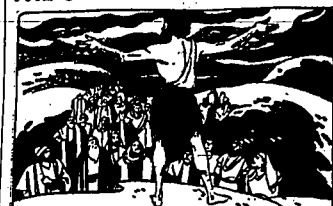
John was telling great crowds that he was preparing the way for the Son of Man. His was the voice of one crying in the wilderness. Prepare ye the way of the Lord, make his paths straight. (Mark 1:2.)