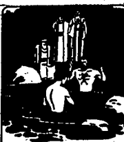
He baptized them in the River Jordan, preaching the baptism of repentance for the remission of the sins. (Mark 1:4.)