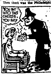
Then there was the Philadelphia... (You bet, who has...)