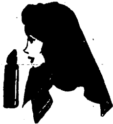
Novelty Boxed Scarf-Candle $1.95

Santa's put his special stamp of approval on Sears' gay collection of holiday dresses. Styles to flatter every figure... one- and two-piece fashions, draped skirts, beautiful interest, smart necklines. All in a host of vivid colors and sophisticated black. You want one of these exciting bead-trim frocks for your most important holiday event. For juniors, misses and all women.