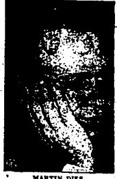
MARTIN DIES Still views... but no more stocher.