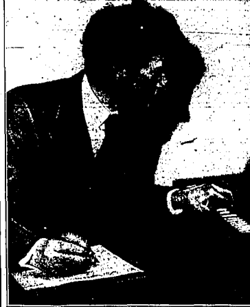
Percy Aldridge Grainger, Australian pianist and composer, who could play Norwegian peasant dances that none of Grainger's countrymen could play, will appear here in concert Tuesday, March 17, at the high school auditorium.