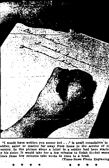
"I would have written you sooner but . . ." is a small consolation to a writer, sailor or marine far away from home in the service of his country. In the picture above a letter to a soldier had been started by his sister. It would take her a few minutes to finish (it—but sometimes those few minutes take weeks to come to a head.)