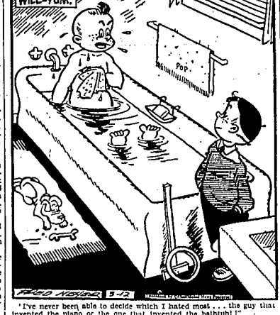
'I've never been able to decide which I hated most... the guy that invented the piano or the one that invented the bathtub!'