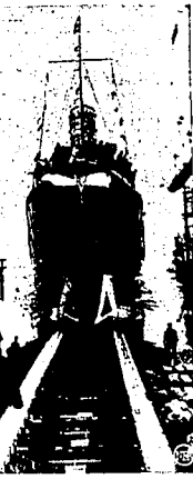
Another member of Uncle Sam's growing pack of sea "greghounds," the destroyer Carmick, hits the waves at Seattle. It's the first of a fleet of 25 to be built there.

given rubber. Tire and tube were approved for a Twin Falls trucker. The stage running to Wells, Nevada and Rupert was given a tire and tube.