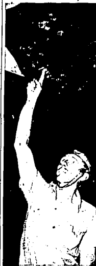
Japanese bullets punched these holes in the wing of a U. S. "flying fortress" in action over the Philippines, but the plane escaped, reaching a point "somewhere in Australia" where it will see further action. This is one of the first pictures to reach the United States showing U. S. forces "down under."