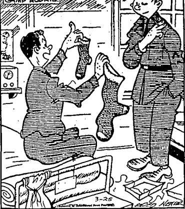
"Something tells me she's sending socks to some other guy in this man's army!"