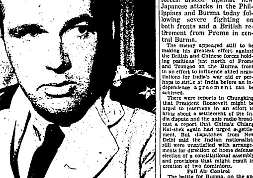
Pictured in Honolulu, here are the fighting features of World War II's newest ace—Lt. Edward H. O'Hare of St. Louis, Mo. In an action in the south Pacific Feb. 26, he single-handedly knocked down six Japanese seven-engine bombers which attacked a United States fleet.

BRITISH SOURCES DENY LANDING OF FOES NEAR INDIA