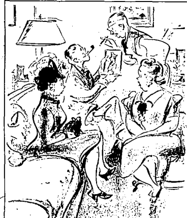
"One thing, I'm sure of—on the basis of the pictures our boys saw of Ball, they never thought of it as a place where they'd be fighting."