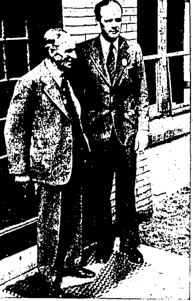
Declaring, "I want to contribute as effectively as I can to the war effort..."