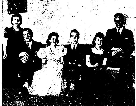
Here's the "royal family" of Albion State Normal school for this year, as decided by student body voting.