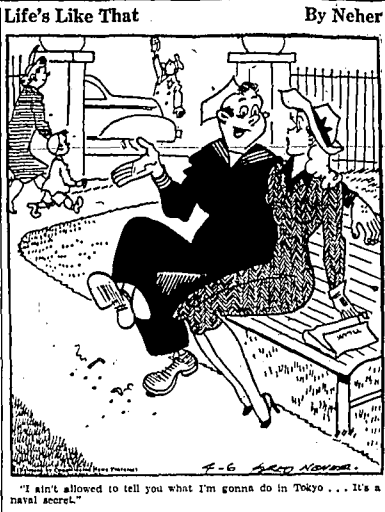
"I ain't allowed to tell you what I'm gonna do in Tokyo... It's a naval secret."