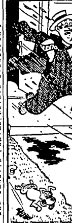
"Don't forget to leave him off at school!"