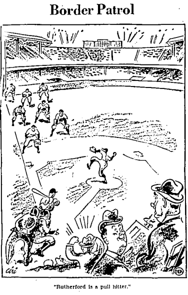
"Rutherford is a pull hitter."