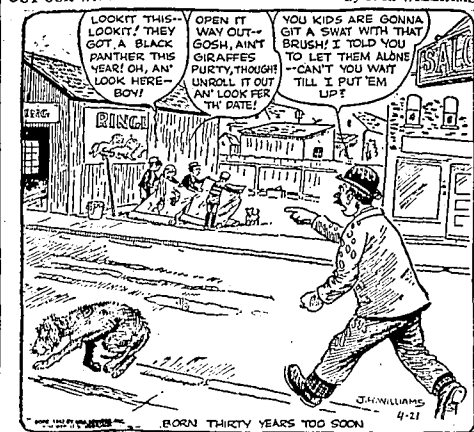
BORN THIRTY YEARS TOO SOON