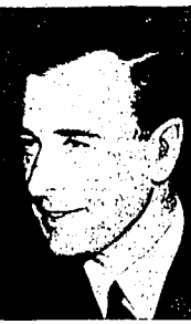
Capt. Lord Louis Mountbatten, cousin of King George, now leads Britain's famed commandos. Mountbatten's distinguished fighting career includes several close brushes with death.