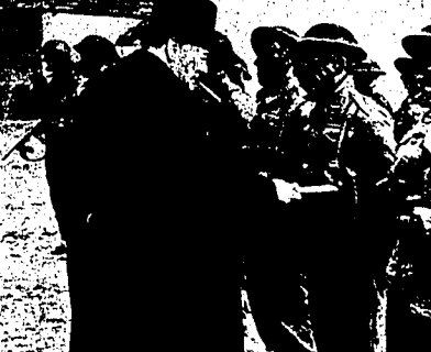
Winston Churchill has a look at a knife carried by one of Britain's famed commandos. Facial blackout featured by commandos makes them harder to see and scares daylight out of Germans in night attacks.