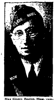
Max Singer, Boston, Mass., commander-in-chief of the Veterans of Foreign Wars of the United States, will speak at Pocatello Wednesday.