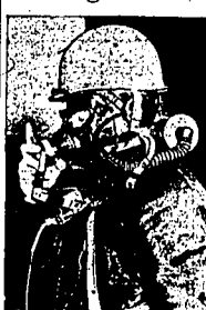
The "laker" of a gun crew aboard a convoyed transport, in the Atlantic line, his job has made easier by the mask he wears during gas drill.