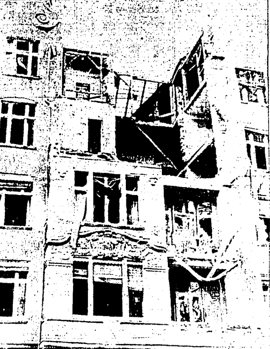
This picture shows bomb damage on Berlin's Meltzke atrium near the headquarters of the anti-air raid organization. It's one of the first original photographs from Berlin since the United States entered the war.

Using Kiska Harbor It is recognized that the Japanese, by jettisoning of airfields on the islands and using the excellent harbor facilities of Kiska, could try to edge, island by island, toward Alaska.