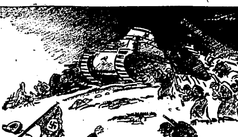
RUSSIA'S WINTER DREAM WHEN IT WAS "TOO COLD TO FIGHT"