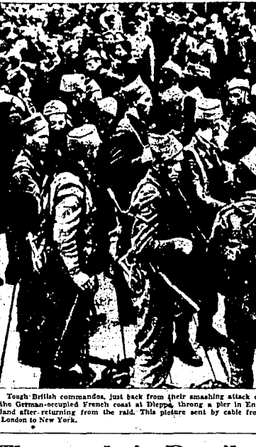
Tough British commandos, just back from their smashing attack on the German-occupied French coast at Dieppe, through a pier in England after returning from the raid. This picture sent by cable from London to New York.