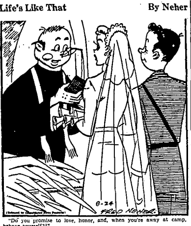
"Do you promise to love, honor, and when you're away at camp, behave yourself?"

WANT AD RATES Based on Cost-per-word 1 day 40 per word per day 3 days 46 per word per day 9 days 50 per word per day