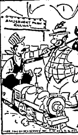
"I'm just being patriotic—I'm leaving the regular railroads for war traffic."