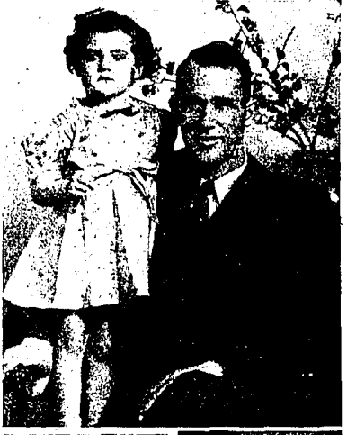
Four victims, and one person who escaped drowning in the Snake lake are shown in the picture above.

WASHINGTON, Aug. 24 (AP)—The inter-allied defense board in a demonstration of hemispheric unity, today unanimously adopted a resolution extending a vote of condolence and friendship to Brazil in connection with its declaration of war against Germany.