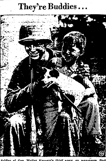
Soldier of Gen. Walter Krueger's third army, on maneuvers, finds time to become acquainted with young Lushlanian and his pet.

Too Late to Classify. CHOICE weaver pig. Also brood sows. Holstein cow. Jersey cow. White 5 points. Before 10 a. m. or after 7 p. m.