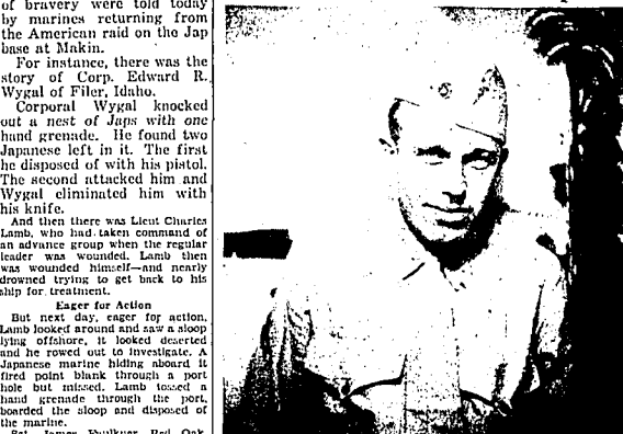
Filer Hero Smashes Japs