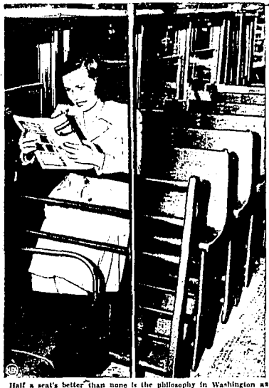
Half a seat's better than none is the philosophy in Washington as capital prepares to install new "stand-it" seats in buses and trolleys to increase wartime seating capacity. All aboard!