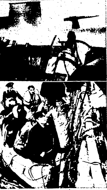
Here's drastic action in the Atlantic hide-and-peek game between the allied anti-sub craft and the enemy underwater raiders...