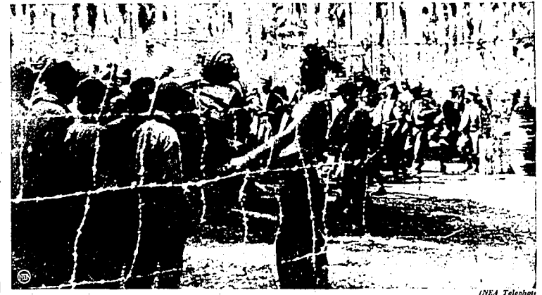
Here, behind barbed wire, you see the fighting sons of the rising sun who knew when they had enough. A U. S. marine, center, lines up a group of Japs while in the background another group is marched off.