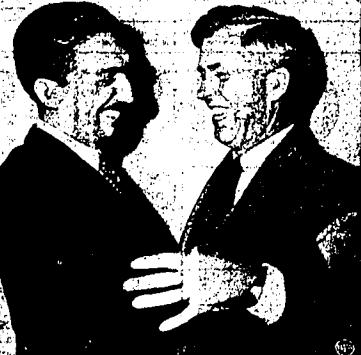
Vice-President Henry A. Wallace, right, and Mexico's Secretary of Interior Alfonso Herrera are seen in friendly embrace as they meet in Los Angeles at ceremonies celebrating the 123rd anniversary of Mexico's Independence.