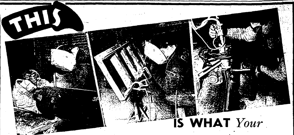
PHOTOGRAPHS . . . These are closeup photos of actual war production in two of the shops of the Idaho Mfg. Co., Kregel's and Self Mfg. Co. 1. Welding compression chambers. 2. Steel ladders for battleships. 3. Acetylene pattern cutting torch.

An editorial from the State Grange, told of the Pendleton meeting of farmers and Grangers to study the use of grains in making plastics for use in the manufacture of syn-