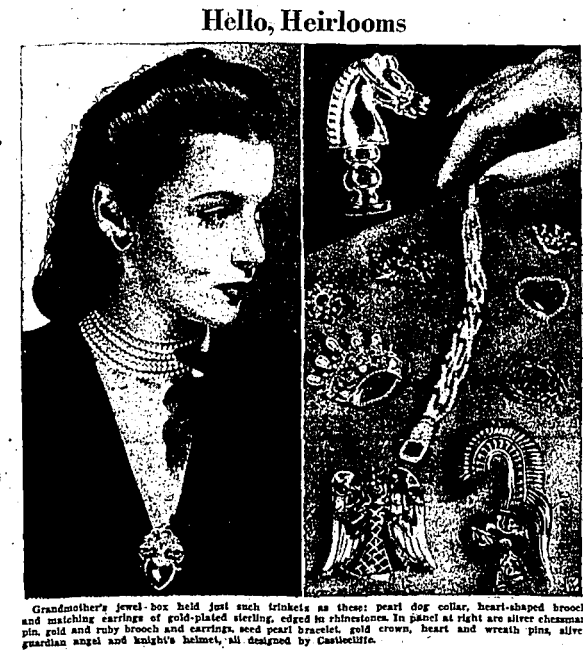
Grandmother's jewel-box held just such trinkets as these: pearl dog collar, heart-shaped brooch and matching earrings of gold-plated sterling, edged in rhinestones. In pocket at right are silver chain, pin, gold and ruby brooch and earrings, seed pearl bracelet, gold crown, heart and wreath pins, silver guardian angel and knight's helmet, all designed by Castleford.