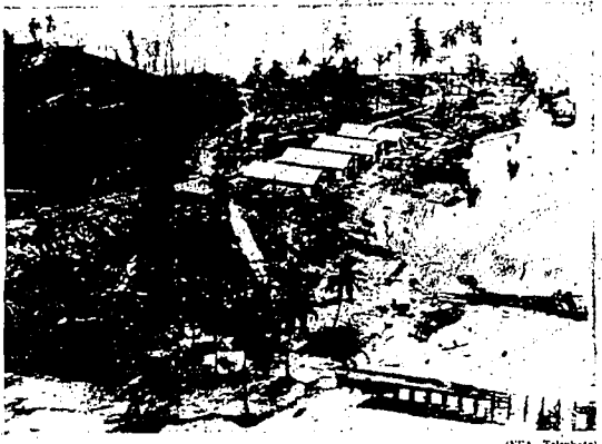
This picture of destruction is Tanambou Island in the Solomons after bombing attacks by United States planes. Note blasted pier (foreground) and wrecked building fronts. This damage was suffered in the American push in the area.

By GEORGE MANUEL DAKAR, French West Africa, Oct. 20 (AP)—Increases in the land, sea and air forces in the area have swelled the white population of this strategic West African base from 18,000 to 200,000. The base was placed on a state of constant alert and women and children were being evacuated by air and sea as rapidly as transport facilities became available. An anti-aircraft unit in effect came to Dakar and the heavy winter rain will be over. A serious housing shortage was reported by the huge population increase. Dakar's white population is concentrated on a curved 13-mile front of land extending into the Atlantic.