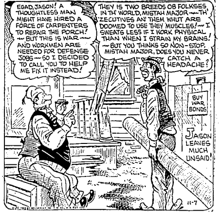
JACON LEAVES MUCH UNSAID 11-7