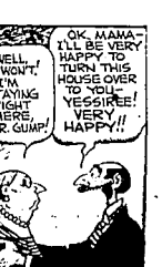
OK, MAMA, I'LL BE VERY VERY HAPPY TO TURN THIS HOUSE OVER TO YOU, MR. GUMPT! 11-7