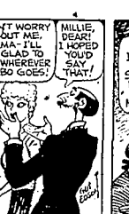
MILLIE, DEAR, I'VE HOPED YOU'D SAY THAT! 11-7