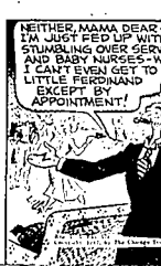
NEITHER, MAMA DEAR— I'VE JUST FED UP WITH STUMBLING OVER SERVANTS AND BABY NURSES— I CAN'T EVEN GET TO SEE LITTLE FERDINAND BY APPOINTMENT! 11-7