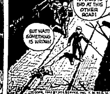
By V. T. HAMLIN