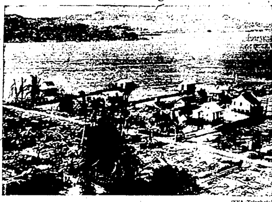
Bombed and shell-swept, this is the shoreline of Tulagi Island, but strategic member of the Solomon group...