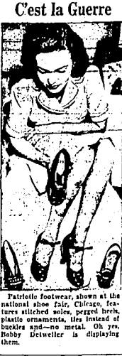
C'est la Guerre