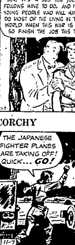
By FRANK ROBBINS