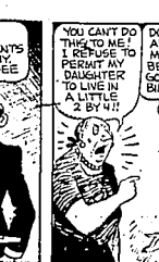
YOU CAN'T DO THAT TO ME! I'VE GOT TO BE GLAD TO GO WHEREVER BANGS GOES! 11-7