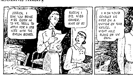
By FRANK ROBBINS