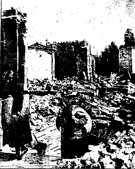
Two Russian women, among their blankets, emerge from Stalingrad bomb shelter after German planes have left the battered Volga city. The red army's terrific offensive against the Nazi invaders may yet force Stalingrad from its siege and wreck Hitler's hopes in the Caucasus.