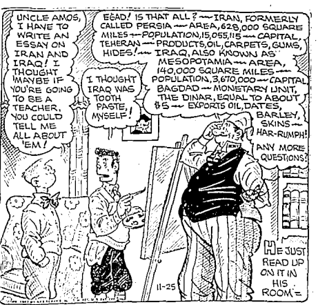
HE JUST READ UP ON IT IN HIS ROOM