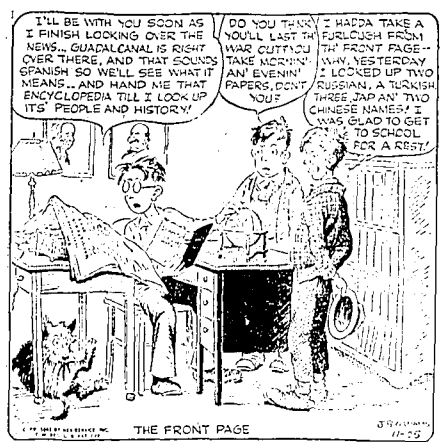
THE FRONT PAGE