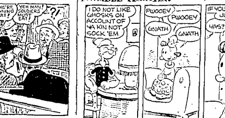
By McEVY and STRIBEL