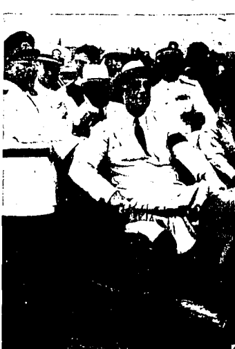
Sleeping on his return to America, President Roosevelt met an inspection tour of the army, navy and air forces of the United States and Brazil at Natal, here with President Getulio Vargas of Brazil (civilian, rear seat) for peers as a Brazilian officer.