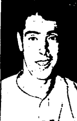
JOE DI MAGGIO

Joe DiMaggio, New York Yankees outfielder, enlists in the army.