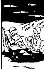
"I can't stand people who eat midnight snacks in bed!"