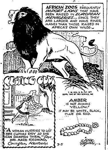
AFRICAN ZOOS FREQUENTLY IMPORT LIONS THAT HAVE BEEN RAISED IN EUROPEAN BACKYARDS. SINCE LIONS ARE LARGER AND HAVE FINER MANES THAN THOSE RAISED IN AFRICA'S OWN WILDS.

AMBER IS NOT ALWAYS YELLOW. IT MAY BE WHITE, BLACK, BLUE OR RED.