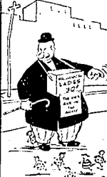
"I said your ship don't show—now get out there with the rest of 'em!"