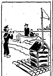
3-27 "No work—I'm not waiting the eight months it took me to build this raft!"

examinations are designed to test the aptitude and general knowledge of the candidates who will express a choice for the army or navy at the time of the examinations. Application blanks may be obtained at the high school principal's office.