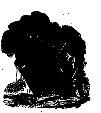
"I told him all about my brother in the Merchant Marine"