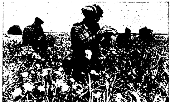
These British eighth army sappers avoid pushing up dunes by arching through a flower field in Tunisia, near Medenine, during the assault on the Mareth line.