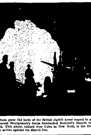
Medium guns (42 inch) of the British eighth army moved in action as General Montgomery's troops bombarded Rommel's Mareth line in Tunisia.