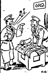
"You'll have to forget your teletype messenger, training in the Army, Private Jones!"