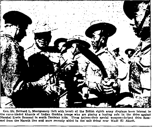
Gen. Sir Bernard L. Montgomery (left with beard) of the British eighth army displays keen interest in the curved-bladed Gurkha of India. Gurkha troops who are playing a leading role in the drive against Marshal Erwin Rommel in north Tunisia. These knives—their special weapon—helped drive Rommel from the Mareth line and more recently aided in the axis defeat near Wadi El Akarit.