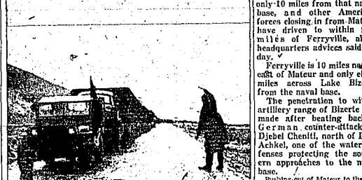
Trans-India U.S. Convoy