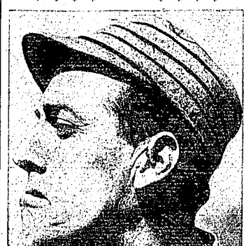
Eddie Plank threw a wicked ball.

Plank pitched in 100 games, won 10, lost 10, pitched in 100 games, won 10, lost 10, pitched in 100 games, won 10, lost 10, pitched in 100 games, won 10, lost 10.