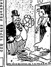
"H. old fat, foolish and Four."