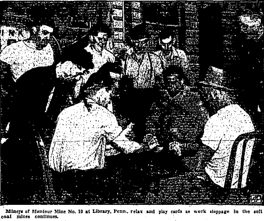
Miners of Montour Mine No. 10 at Library, Penn. relax and play cards as work stoppage in the coal mines continues.

LONG BEACH, Calif., June 4 (AP)—The city's 100-day bus strike was called off today as a settlement was reached between the union and the city. The settlement provided for a 10% wage increase and a shorter work week. The city had offered to pay the union $100,000 to settle the strike.