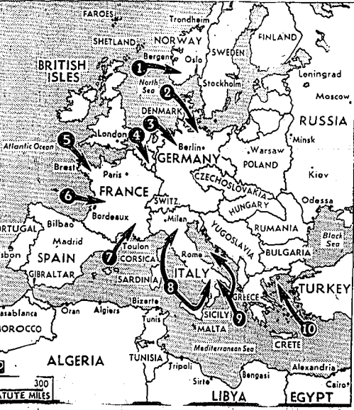
This map indicates 10 possible routes of invasion of Nazi-occupied Europe as planned in the 1942-43 military program...