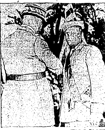
In a ceremony which took place at Park High, Aligier, French leader Gen. Henri Graud, left, decorates Gen. Dwight W. Eisenhower with the grand cross Legion of Honor. The occasion took place to celebrate the allied victory in Tunisia.