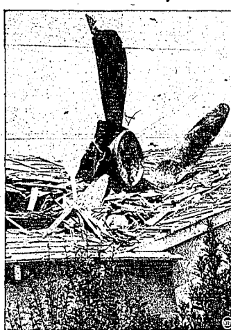
Here's a fatal result when a pilot disobeys regulations concerning low flying over residential districts. The propeller of a P-38 army fighter plane which damaged five residences in Van Nuys, Calif., was hurled into the air and landed in the front yard. The pilot, who was killed, was killed in the spectacular crash. The housewife was burned to death in her own home.