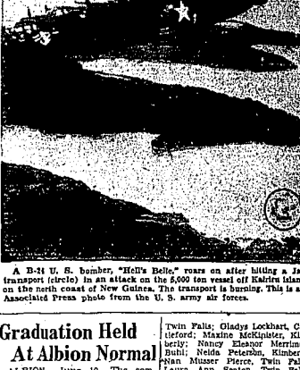
A B-24 U. S. bomber, 'Holla Bolla' roars on after hitting a Jap transport (circle) in an attack on the 6,000 ton vessel off Kaituma Island on the north coast of New Guinea. The transport is burning.