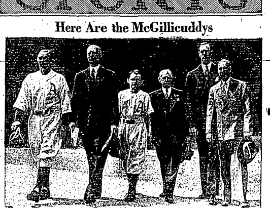
The Macks of Philadelphia form baseball's most famous family. Most widely publicized, of course, is Cornelius McGillicuddy, known as Connie Mack, manager of the Philadelphia Athletics for more than 30 years.