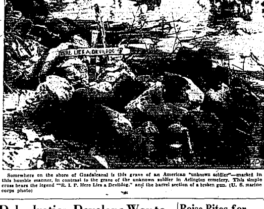
Somewhere on the slopes of Guadalcanal is this grave of an American 'unknown soldier'—marked in the humble manner. In contrast to the grave of the unknown soldier in Arlington cemetery, this simple cross bears the legend 'I. P. Here Lies a Devil' and the barrel section of a broken gun.