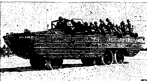
Capable of hauling troops and equipment on land and across water, the army's new DUKW amphibious truck cruised along the sands of a beach near Carrabelle, Fla., with a load of fully-equipped troops at a demonstration by the 3rd amphibian engineer command.