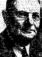
LEWISTON MAYOR LEWISTON, June 15 (AP)—With a 150-vote lead, Vermer B. Olsen, a Republican, apparently was elected mayor of Lewiston. He had an unofficial ballot total of 145 compared with 1,007 for M. B. Mickelson, also a Republican.

Some crabs resemble small stones of the beach where they dwell.