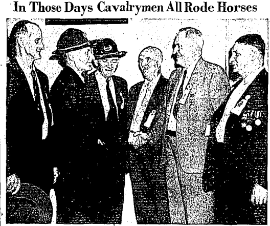
This is one of the groups that gave old times a good going over, as veterans of the nation's "wild war" gathered at the Repton hotel Sunday for opening of the 10th annual encampment of the Idaho Department of Veterans Affairs.

WASHINGTON, June 28 (AP)—American battleships have steamed into the Mediterranean to reinforce British squadrons preparing to escort allied landing forces to the shores of Sicily in Europe, the uncontrolled Scandinavian Telegraph Bureau reported today.