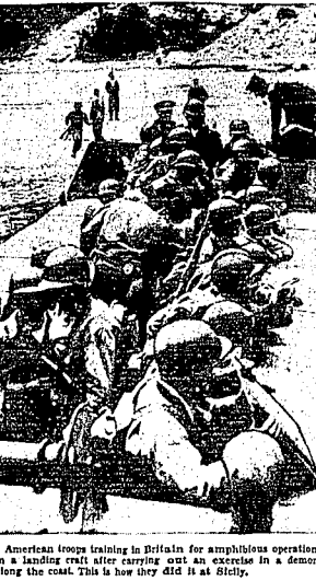
American troops training in Britain for amphibious operations return in a landing craft after carrying out an exercise in a demonstration along the coast. This is how they did it at Sicily.