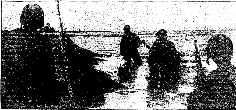
JUST ONE TABLESPOONFUL of used kitchen grease will fire five bullets. Five bullets can mean the difference between life and death to soldiers like these. You can save at least a tablespoonful a day in spite of rationing.

So, after you have got all the cooking good out of fats from frying, roasting, broiling, etc., save them in a can. Any can, even a soup can will do. (It will go to tin salvage afterwards.) The moment you have a canful, rush it to your Twin Falls meat dealer. In just three weeks' time it will be gunpowder . . . to be used in the war-vital ways you see pictured here.