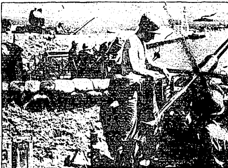
A SPOONFUL A DAY for one month adds up to a pound of fat—which makes gunpowder enough to fire five big 37 mm. anti-aircraft shells like the ones you see here all set to bring down a Nazi bomber. Remember, your Government wants you to get all the cooking good out of your kitchen fats first—then send them to war.