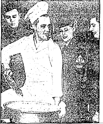
BOTH THE ARMY and the NAVY take time to save used kitchen grease. They know how urgently it's needed. Soap skimmings, pan drippings, old shortening—all are wanted. Save them!