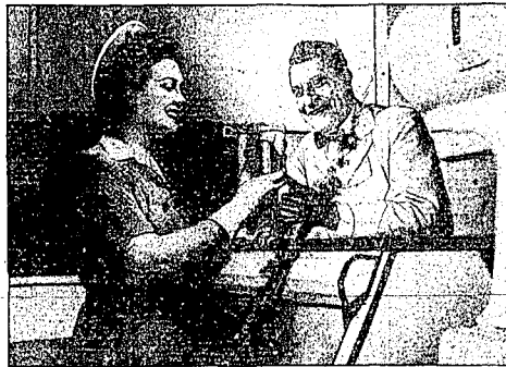
THIS MAY NOT look like a battle picture—but the fat in that can is on its way to the firing line. Even at the rate of a tablespoon a day, you can fill a can surprisingly fast. As soon as you have a canful, rush it to your meat dealer. Three weeks later it will be in the gunpowder factory.

HELP TWIN FALLS COUNTY MEET ITS FAT SALVAGE QUOTA! Save drippings, used grease . . . turn it in as it's saved. We've been way behind—let's get ahead!