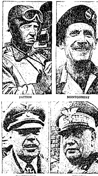
General Patton and General Montgomery, Allied commanders in Sicily.