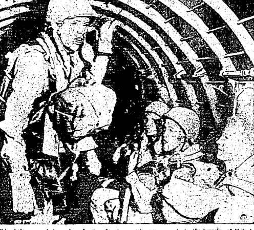
This photo was made in a plane bearing American paratroopers en route to the invasion of Sicily by Allied forces. Lt. Col. Charles W. Keenan, standing, midway to Sicily tells his men: "Your destination is the Italian island of Sicily, and you will be first American troops to land."