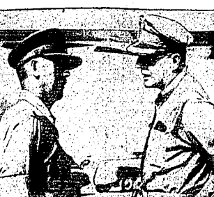
General Douglas MacArthur (right), conferred with Australian Lieut. Col. F. Herring in New Guinea, at the start of the latter's offensive in that area. Picture radioed from Melbourne to San Francisco.