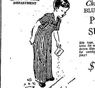
Children's BLUE DENIM PLAY SUITS $1.79