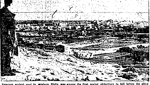
Syracuse, ancient port in western Sicily, was among the first major objectives to fall before the allied forces launching their pre-continental invasion. Above, general view of the port which has seen war many times during the past 2,500 years. It is a key base for aircraft and surface.