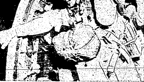
The invasion of Sicily is being led by Lt. Col. Charles W. Keenan. The green light for the assault on Sicily was given today by the Allied command.

ROME, July 13 (AP)—The green light for the assault on Sicily was given today by the Allied command. The assault is expected to begin within a few days.