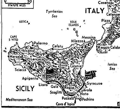
British invasion forces were striking along the Sicilian coast today toward the key base of Catania (see broken line). After American and British forces captured approximately 15 miles of Catania in a northeast surge up the slopes of the mountain, and killed upon two German armored divisions and severely mangled them.