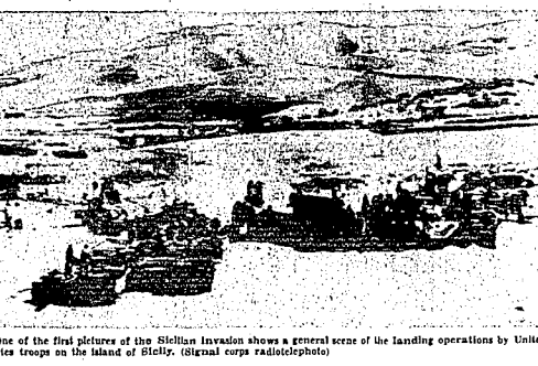
One of the first pictures of the Sicilian invasion shows a general scene of the landing operations by United States troops on the island of Sicily.