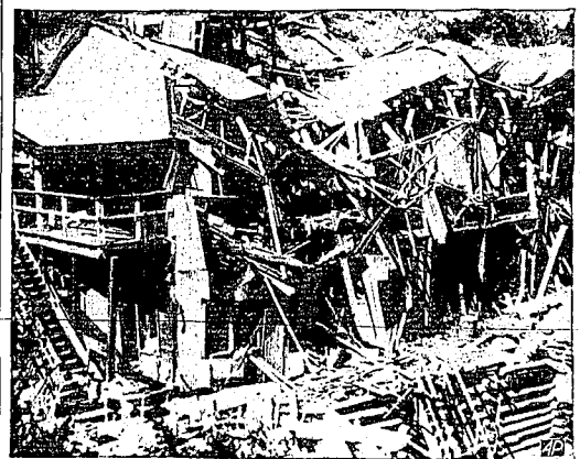
Shattered wreckage of what had remained of a boarding house on the Little Falls, Idaho, after fire exploded five tons of dynamite July 20 miners excavating the building. The blast was heard 11 miles. None was injured.