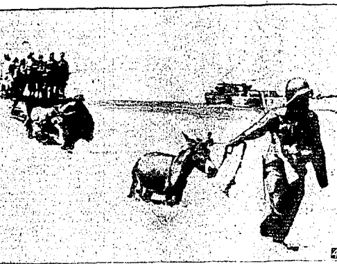
This picture proves him wrong, for as U. S. forces landed on Sicily's shores, they took along army pack mules, leading them off landing boats through the surf.