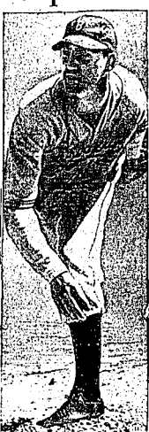
"SCHOOLBOY" ROWE - Former Detroit pitcher...