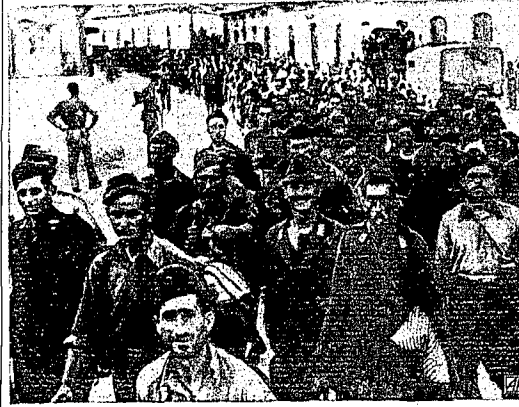
A column of Italian prisoners moved through Syracuse, Sicily, en route to an allied internment camp.