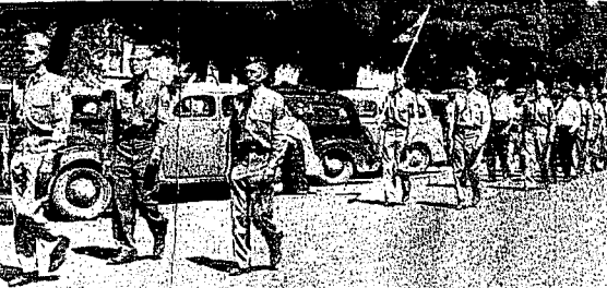
Members of the Idaho volunteer reserves gave a snappy military touch to the Pioneer day celebration at Hagerman ground, followed by Co. 2, Gooding, 1st (Infantry)...