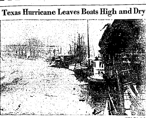
Texas latest hurricane blew the water right out of Buffalo bay, near Houston, and left these boats high and dry. Life was gradually returning to normal today along the Texas golf coast, where the hurricane, worst since 1915, left 14 persons dead, three unaccounted for and damage estimated at nearly $100,000.