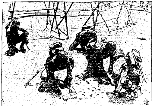
Always ahead of the advancing troops in the Sicily invasion, 30 three-mile wide aerial reconnaissance photos here uncovering land mines in the vicinity of Patuma in the Sicilian invasion.