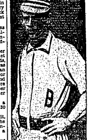
McGraw of the Orioles

McGraw was paid $10,000 for a single season's play more than any other player before him. He was the hardest hitting third baseman of all time.