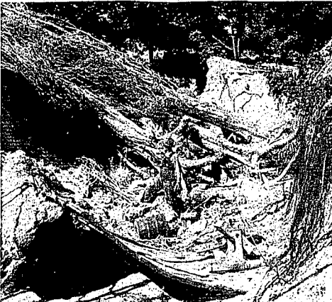
The huge gully cut by overflow last December from one of the lakes at Blue Lakes ranch is shown in the photo above, with T. O. Palmer, caretaker, pointing to the place where three Lombardy poplars project over the top of the cut. The camera points north.