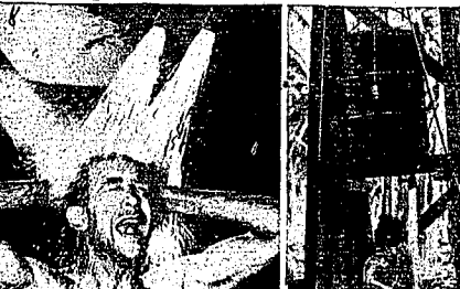
After the heat of battle there's nothing like a refreshing shower to make a new man of a soldier. And incandescent solid light makes way to engage in cleaning up operations. Mobile bath units, captured in Italy, Africa, Africa and on maneuvers in the U. S.