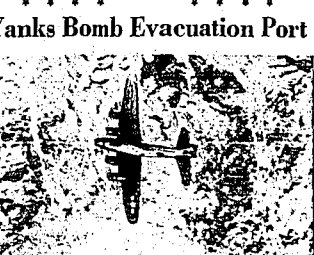
As German began large-scale evacuation of their troops and equipment from Sicily, a U. S. Army force Friday fired rockets from a new wing and tank brigade, plus other troops to the port of Messina, Italy, and shelled the evacuation of the island.

ALLIED HEADQUARTERS IN NORTH AFRICA, Aug. 14 (AP)—Allied air and naval forces drew a ring of fire around the strait of Messina today in a bombing and shelling battle against German troops who had begun a wholesale withdrawal from Sicily for a stand in Italy. Only about 34 miles from Messina, American and British troops fought up the slopes of all sides after smashing through the fire-sepved crossroads of Randazzo, capturing the town and the nearby coast. Foresta in the middle section of the front, and Riposto, Giarre and Milo on the east coast. They were encountering stiff resistance from well-organized and ferocious German troops, and were putting every obstacle in the way that ingeniously could be devised to stop them from reaching the retreat was accelerating and that the evacuation of the island was now only a matter of days. They were encountering stiff resistance from well-organized and ferocious German troops, and were putting every obstacle in the way that ingeniously could be devised to stop them from reaching the retreat was accelerating and that the evacuation of the island was now only a matter of days.