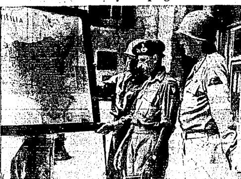
On the piazza of the royal palace of Palermo, former seat of Mussolini's rule over Sicily, high allied commanders study a map of the island and plan the finish of the Sicilian campaign...