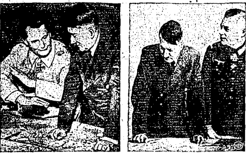
Relinquishing command? Hitler confers with aides Goering, left, and Keitel, right, at headquarters.

Reichsmarschall Herman Goering, Grand Admiral Karl Doornik and Field Marshal Wilhelm Keitel are struggling to produce a new and this time Hitler who is said to be on the way out. Spanish reports say Goering, Reichsmarschall Hermann Goering, Field Marshal Wilhelm Keitel, chief of the high command, and Grand Admiral Karl Doornik, commander-in-chief of the navy, as his partners in a triumvirate government. To show you that a grain of salt is needed with all this, allied leaders in London don't believe it although they do assert it is probable Hitler has not been actual military leader of Nazi politics for some time.