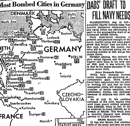
This is an up-to-date map report of German cities that have been bombed by the allies, with the names of the cities and the number of times they have been bombed...