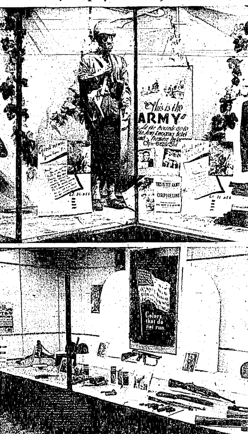
Here are two of the downtown window displays which helped promote the army relief fund premiere of "This Is the Army." Top, the Idaho department store window featuring a soldier manikin in full equipment including battle helmet, gas mask, rifle, and boots. Bottom, the Idaho department store window featuring a soldier manikin in full equipment including battle helmet, gas mask, rifle, and boots.