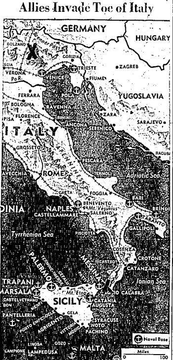
Map showing the invasion route from Sicily to the Italian mainland, with labels for various cities and regions.

BOISE, Sept. 3 (AP)—Agriculture and Food Administration today authorized loans for purposes water and irrigation projects in the West.