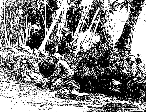
When a soldier looks death in the face, he often finds it smiling back at him. The soldier in the foreground is looking towards the camera with a somber expression. The trench is filled with earth and there are some supplies visible.