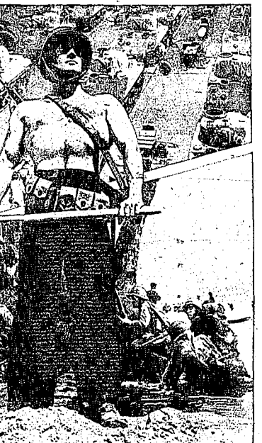
On this Labor Day, 1943, as the nation honors its working men and women...