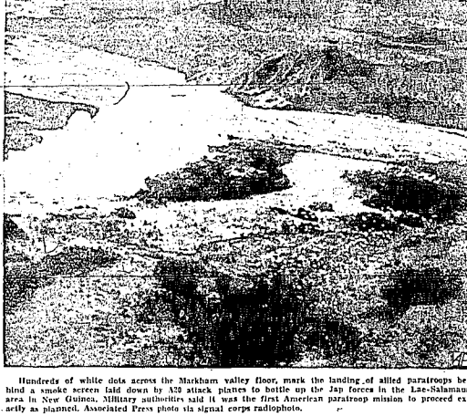
Hundreds of white dots across the Markham valley floor, mark the landing of allied paratroops behind a smoke screen laid down by 432 attack planes to battle up the Zap forces in the Lae-Salamaca area in New Guinea. Military authorities said it was the first American paratroop mission to proceed exactly as planned.