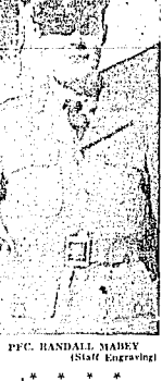
PFC HANDAHL MABEY