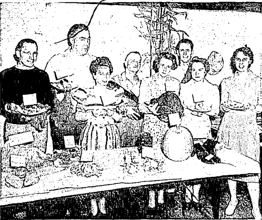
O. A. O. "County Fair" dance committee displaying with natural pride the home grown produce...