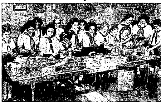
These members of the Camp Fire girls are busy at work folding explanatory leaflets for the county campaign of the Idaho War Fund...