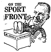
ON THE SPORT FRONT A ROTHSCHILDE player