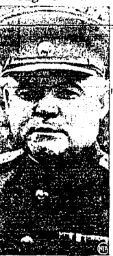
Rough on Nazis