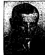
Vladimir E. Huban Ambassador of Czechoslovakia

We urge you to see the dramatic displays in our store windows, honoring the "Unconquerables" of the world