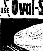
AIR DRIES OVAL-SHAPE CAKE OF SWEETHEART SOAP SO IT STAYS FIRM - LASTS LONGER!

WANTS a cut for the duration—to save with oval shape Sweetheart Soap. Unlike many soaps that do not, only a small part of Sweetheart's big oval cake actually touches the surface. Air dries off fast... helps avoid wasteful "jelly" in the wet soap dish. Change now to Sweetheart, the only soap among night leading brands that comes in the long-lasting oval shape.