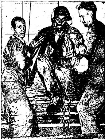
A bath-shakened marine hops over the rail onto the deck of an assault transport after by two coast guardsmen after two days of intensive fighting on Eniwetok atoll in the Marshalls. His face is black from burning in coral dirt to keep covered from enemy snipers.