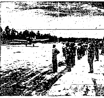
Yanks stood at the edge of the landing strip on Los Negros Island in the Admiralty group in the Pacific to watch arrival of an Australian air unit, first to the field which U. S. navy seafarers rebuilt after capture of the island from the Japs.